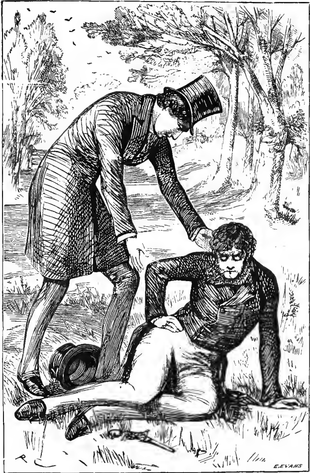
The Major is Hit Hard.